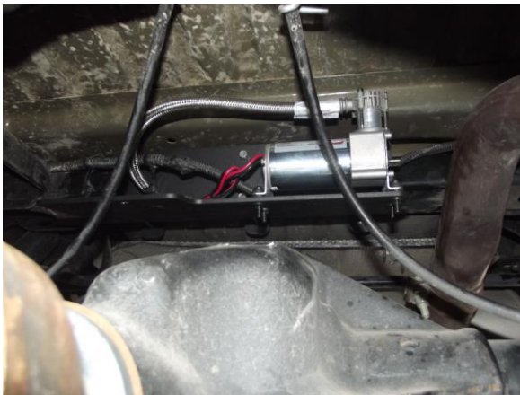
Photo 5 – Compressor on mounting bracket, as seen from the front of the vehicle.