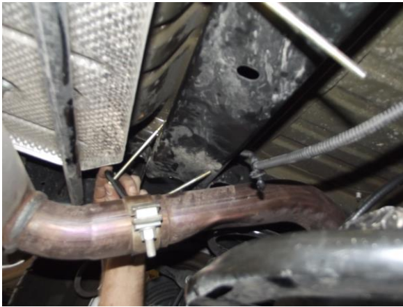
Photo 3 – Slide the rear mount plate/bolt assemblies over the beam. Work from the driver's side and slide the assemblies towards the passenger's side