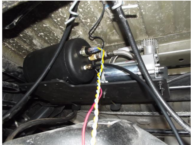
Photo 8 – Air tank positioned on mounting bracket. Note how the braided steel leader hose is looped between the compressor body and the mounting bracket.